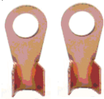
2X 60A TERMINALS INCLUDED