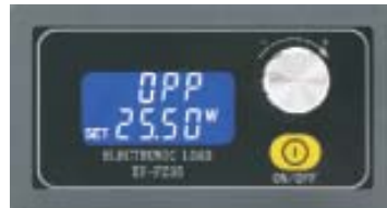
SET OVER POWER Default 35.5W

E: To Exit & Save settings, long press >3sec. the digital potentiometer/switch