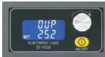
SET OVER VOLTAGE Default 25.2V