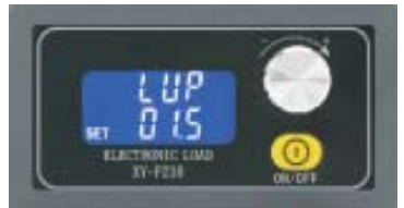
SET LOW VOLTAGE Default 1.5V