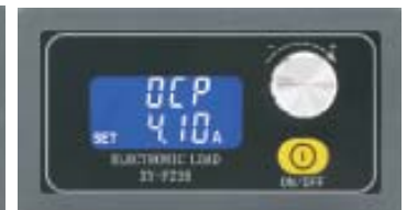
SET OVER CURRENT Default 5.10A

A: In the normal Operating Mode, long press >3sec of the digital potentiometer/switch to enter the Set Mode.