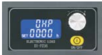
SET DISCHARGE TIME